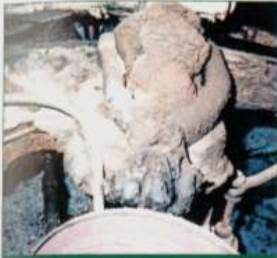
The front suspension first had to be chiselled free of the layers of caked concrete