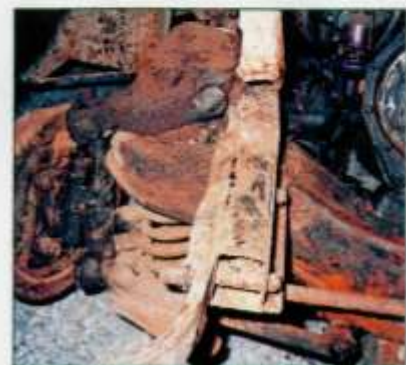
The inner suspension nuts were welded on solidly