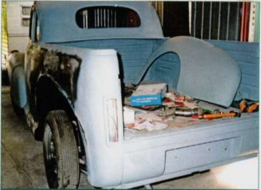
Repairs were made to the body around the wheel arch before the mudguard was attached