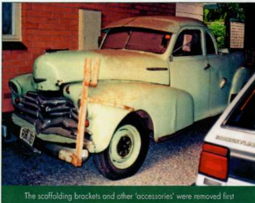
The scaffolding brackets and other 'accessories' were removed first