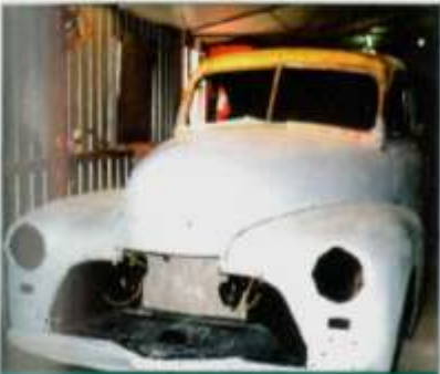
The straightening process is under way